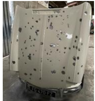
This shot from the internet shows a Spitfire's bad encounter with a hail storm. Ouch!