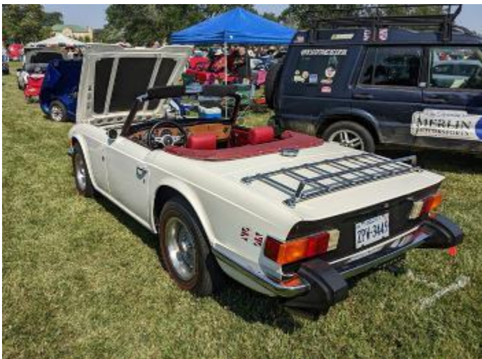
One more Triumph spotted at the AACA show.