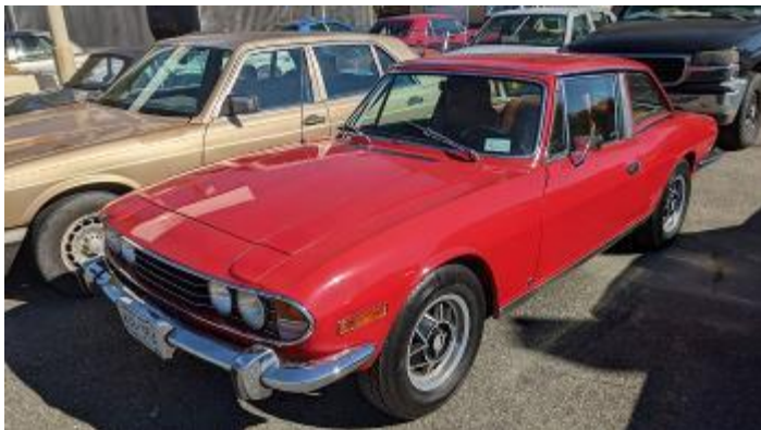
Another Triumph Stag spotted in Richmond. This one, with NY plates, has been parked in front of the Mercer and Woodson shop on Lakeside for the last few weeks. Anybody know the owner?