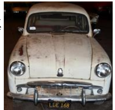
1959 Triumph TR10: Sold for $6700