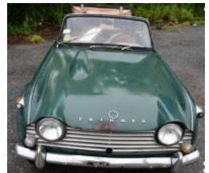
1966 TR4A: Sold for $2600

auction block. The most expensive British car sold was a 1960 Austin Healey that went for $92,500. A lot of pretty rare parts went for remarkable prices. A Bugatti radiator and grill sold for $10,000! Somebody spent $200 on a salesman sample toilet seat. Sorry I missed that! The cheapest car sold? A very ratty and rusted MG for $30.