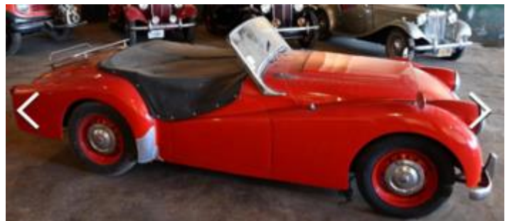
1955 TR2: Sold for $8750

Foreign cars and parts were highlighted the third day of the auction, with more than 100 British, German, Swedish and Japanese classics crossing the