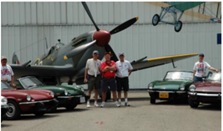
I recently came across this picture from RTR's 2004 hosting of the VTR national convention. Brings back memories!