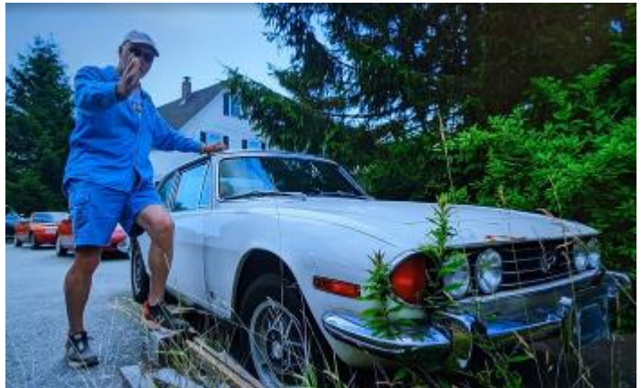
Speaking of Stags, one pops up on the most recent edition of the popular YouTube series "Barn Find Hunter."