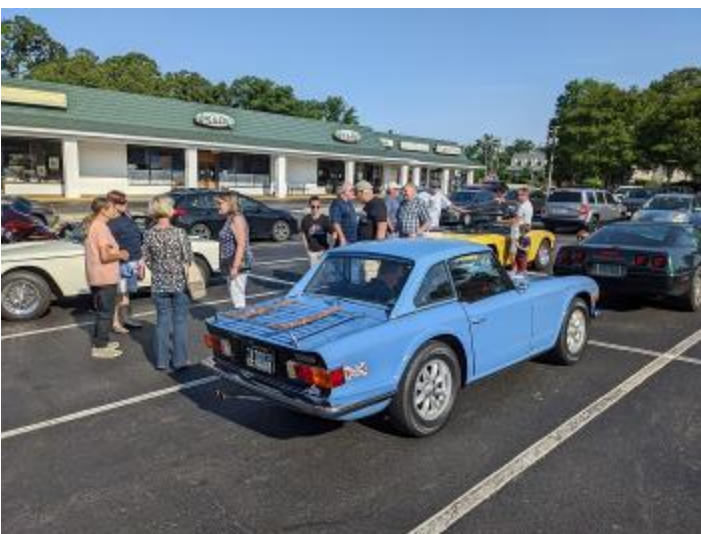
A great turn-out for the May 21st RTR breakfast at Joe's Inn Bon Air, with more than 25 attending.

I believe the really old car between the last TR7 and Stag is a Triumph 10/20 , the first Triumph automobile. Way cool!