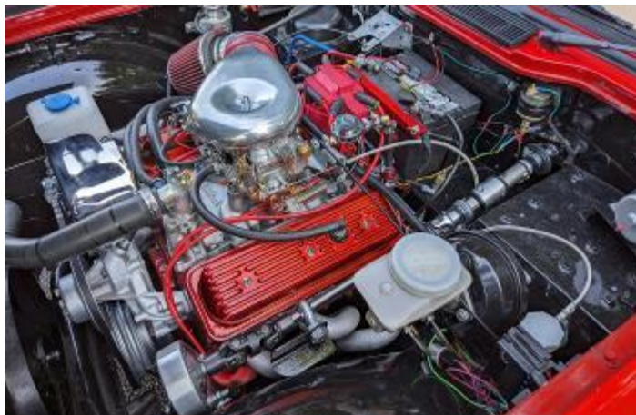
A V6 in a TR6.