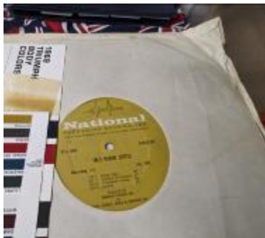
Don't think this record of TR3 radio spots made Billboard's top 40.