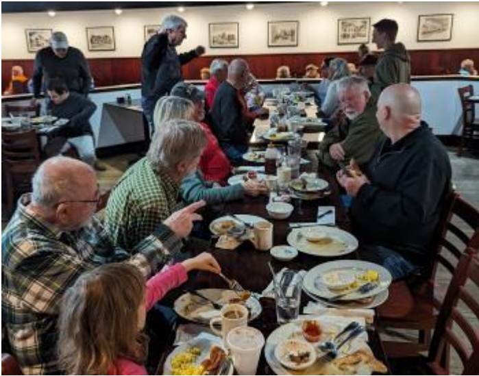
Another fantastic turn-out with 25+ hungry RTR members and friends attending our April 20th British Car Breakfast at Joe's Inn Bon Air. Great to see the owners of three MGs joining us.