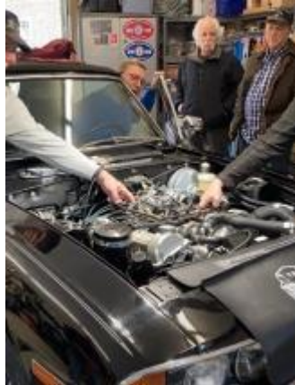
No fingers were lost in the starting of this car.