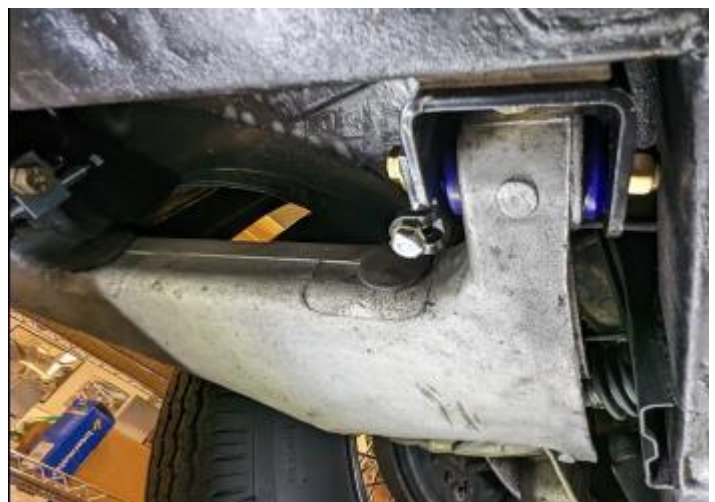
New poly trailing arm bushings on Don's 1968 TR250.