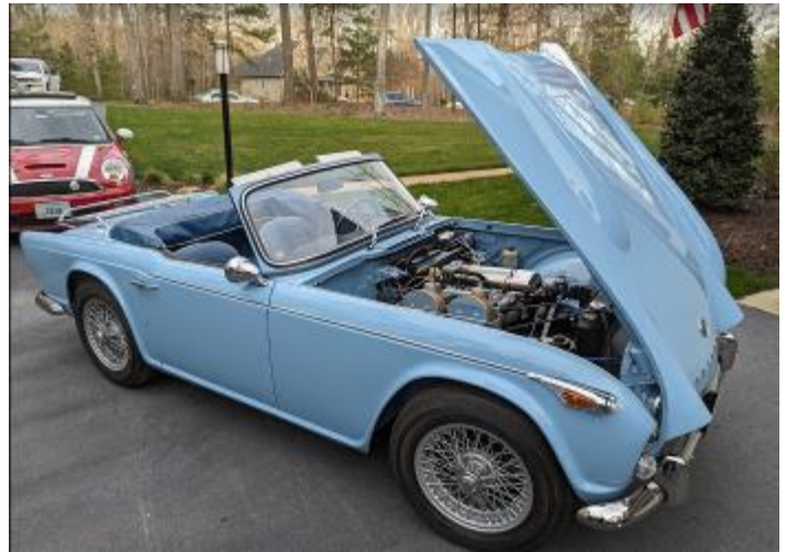
Baxter Phillips's 1967 TR4A

See more meeting and tech session pictures here .