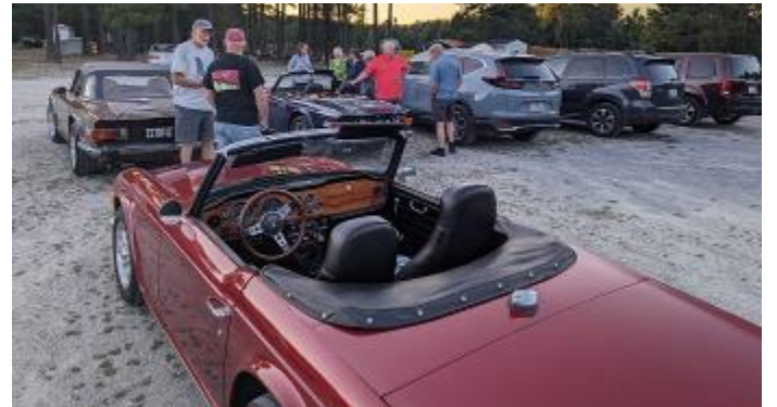
RTR at the Sept. 15th Jimmers Frozen Custard run.